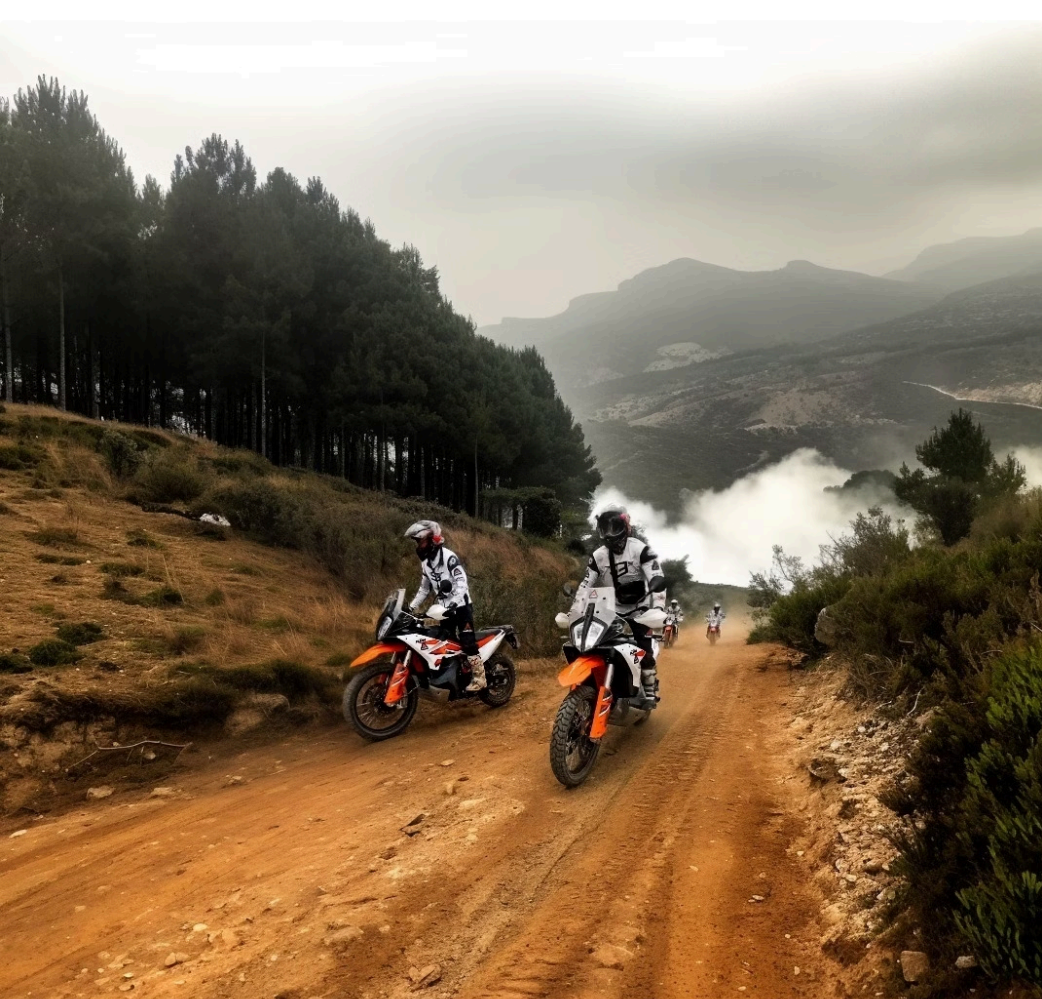
After lunch another nice gravel