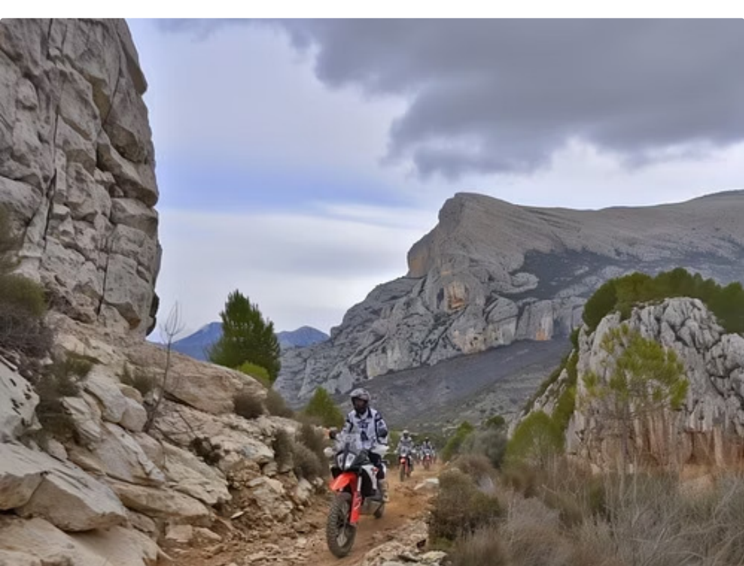
After an amazing ride back to Almuñécar