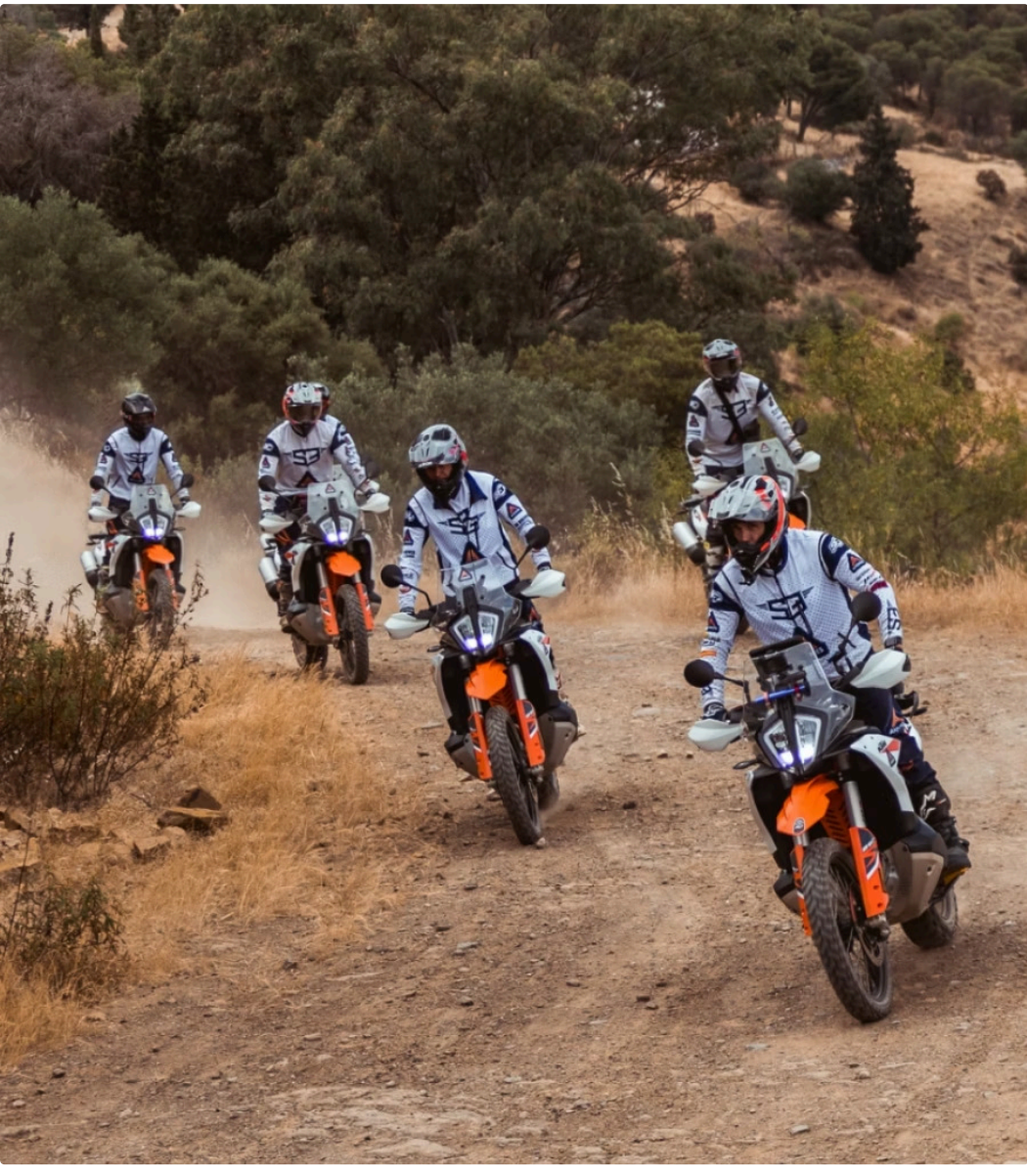
we ride tracks that cross passes with impressive views